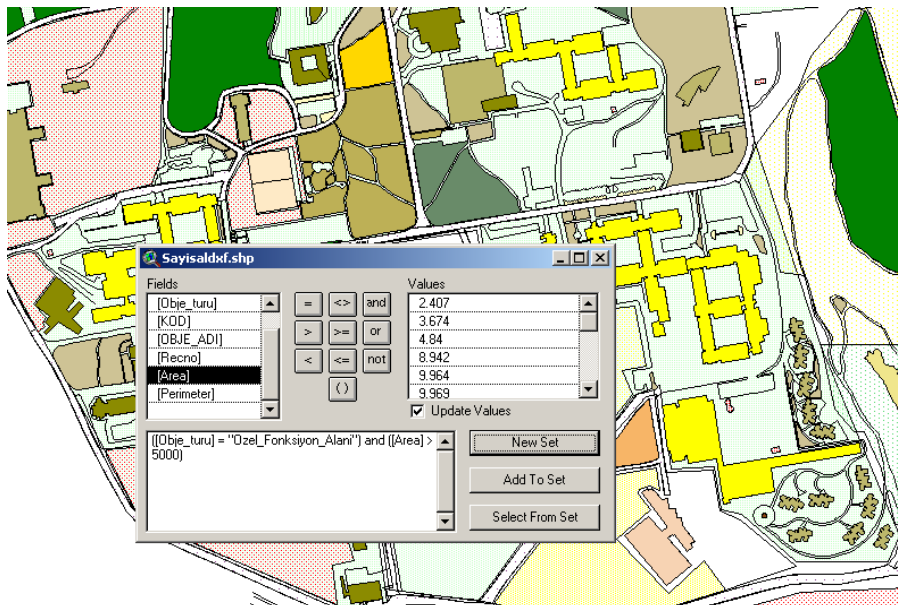
Figure 2. An example from the project, identifying the object types named building and has larger area than 5000 m 2

The system is very scalable because of the possibility of gathering more attribute data, so making more analyses due to the planning or management aims like showing the buildings have more floors than 8 and have fire escape, have night population bigger than 20...etc.